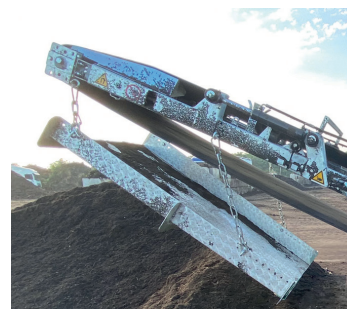
Magnetic Head Pulley