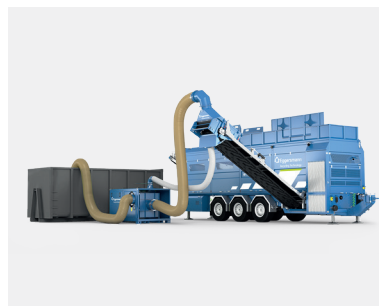
STAR SELECT Star Screen Machines