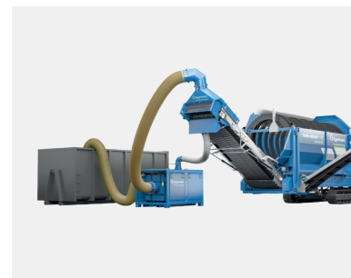
TERRA SELECT Trommel Screen Machines