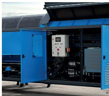
Large Maintenance Doors