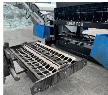
Screen Basket System