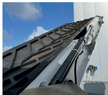
Discharge Height up to 4,100 mm