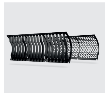
Screen Basket System