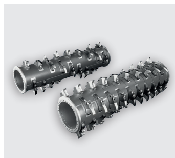
30 / 40 Tool Rotor